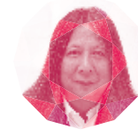
JOHN ROCHA CBE